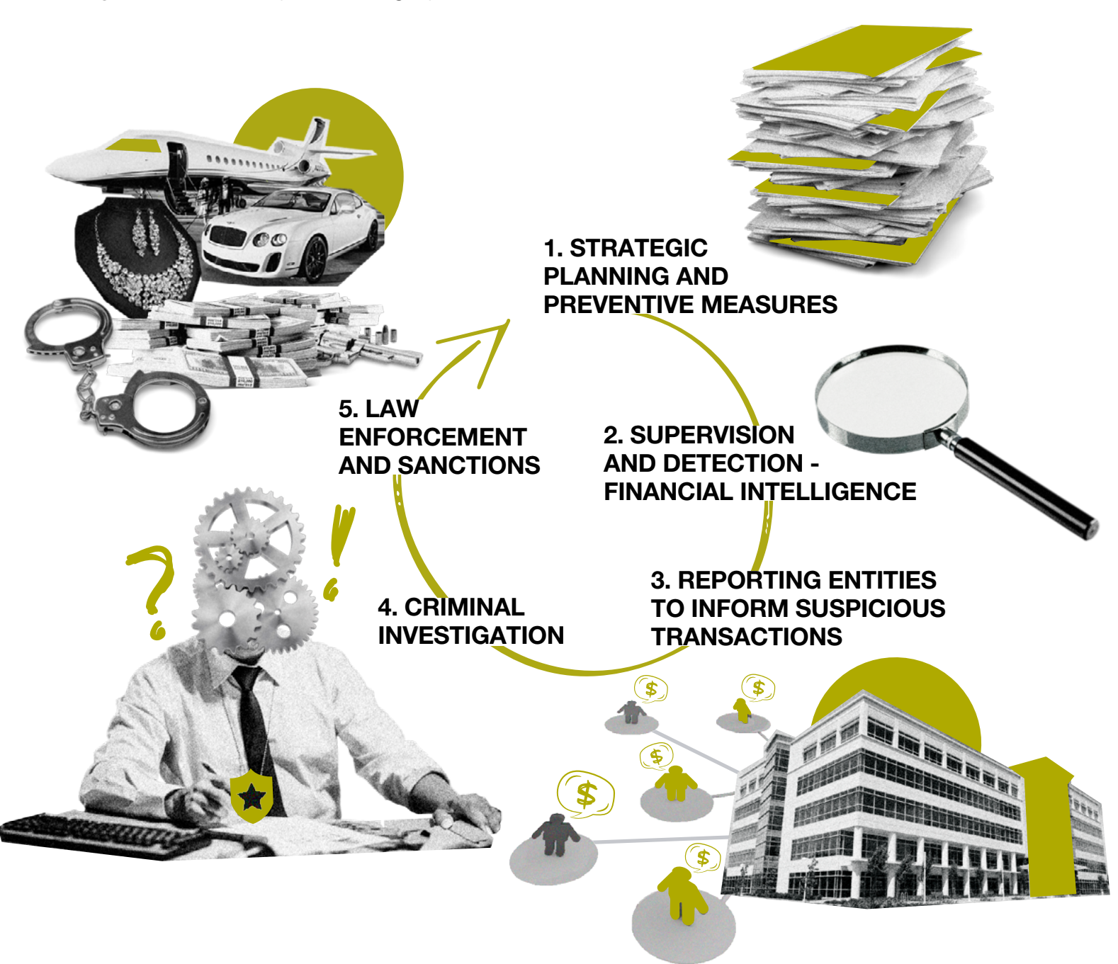
Figure 1. Anti-Money Laundering Cycle of Action

This paper is organized into two sections, the first one analyzes the anti-money laundering governance capacity in each country, with a focus on the dimensions outlined in the proposed analytical framework. The second section presents a series of recommendations aimed at enhancing regional cooperation and improving strategic and operational aspects of anti-money laundering frameworks. The paper ends with final considerations on the regional perspective.