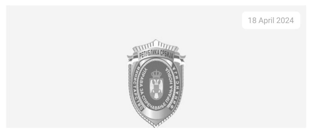
FATF publishes so called "grey" and "black" list

Administration for the Prevention of Money Laundering calls on all obliged entities to check these two publications on FATF website on a regular basis.