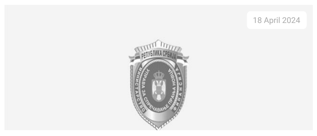
FATF publishes so called "grey" and "black" list